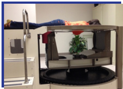
Dedicated breast CT scanner

For conventional x-rays, the amount of radiation delivered to a patient is extremely small. However, for a CT exam, such as a study of the abdomen, the radiation delivered to the patient can be equivalent to as many as 400 chest x-rays. Similarly, a CT exam of the head can produce the equivalent of about 100 chest x-rays.[3] For this reason, it's important that CT exams are limited only to those cases where the benefit to be gained greatly outweighs the increased risk. This is especially true for children, who are more sensitive to ionizing radiation and have a longer life expectancy and, thus, have a higher relative risk for developing cancer than adults. [1,2] Also, a child's smaller size affects the amount of radiation dose received. For this reason, when scanning children, equipment settings need to be adjusted to reduce the radiation dose while maintaining high image quality.